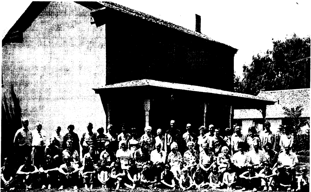
Family Association reunion at the Jesse N. Smith home, Parowan, Aug. 14, 1971